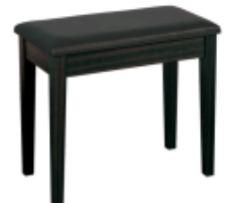
Matching Piano Bench Included